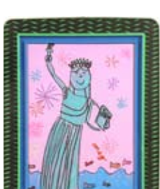
Art by Meg Haveman, age 7

Our new Paraflex Acrylic frames are all of these. Whether you're framing family photographs or original artwork, Paraflex protects, preserves and creates a showcase for your priceless treasures. We love to design with these creative frames. We choose shape, width, color and pattern; there are thousands of possible combinations.