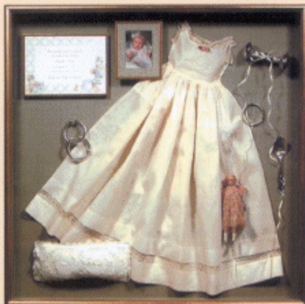
Remember Pat's Birthday

Remember Weddings "A custom framed wedding invitation is always appreciated"