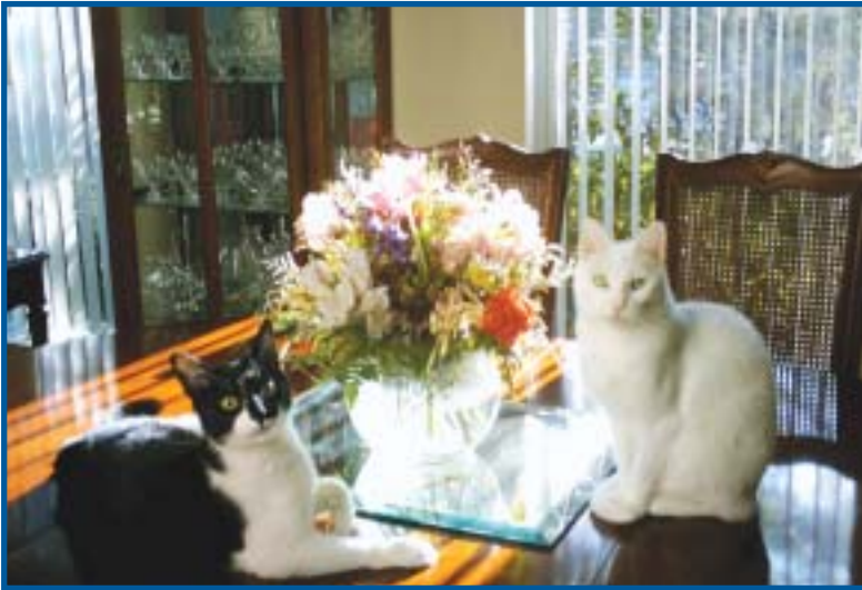
Everybody loves Lily. We thought you might want to meet her "little brother" Baxter. They both decided to pose quite elegantly.