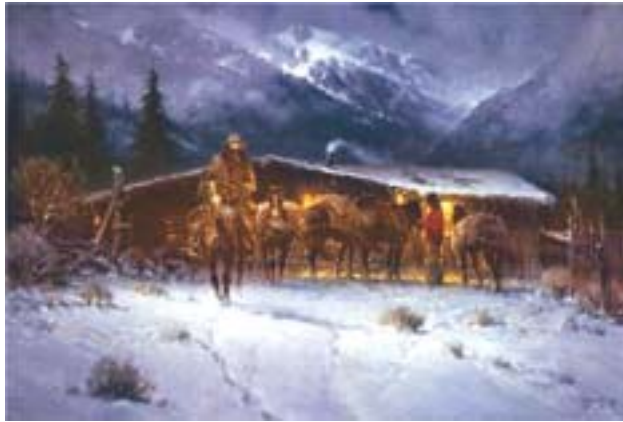
G. Harvey "Leaving the High Country" 36 x 24 Canvas $495.