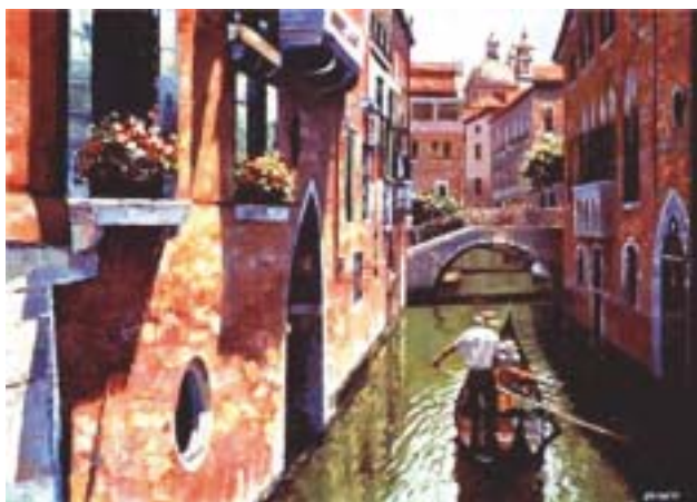
Howard Behrens "Pink Canal" 30 x 24 Canvas $495.

www.bradleysartandframe.com is our main informational and education site. We would love your feedback: