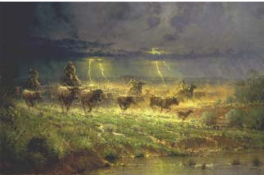
"Rawhide and Thunder" 36 x 24 canvas Edition 950 $495.