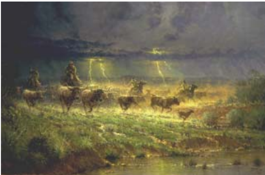
"Rawhide and Thunder" 36 x 24 canvas Edition 950 $495.