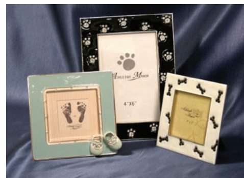
Photo Frames Make Perfect Gifts