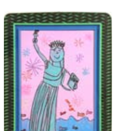
Art by Meg Haveman, age 7

Our new Paraflex Acrylic frames are all of these. Whether you're framing family photographs or original artwork, Paraflex protects, preserves and creates a showcase for your priceless treasures. We love to design with these creative frames. We choose shape, width, color and pattern; there are thousands of possible combinations.