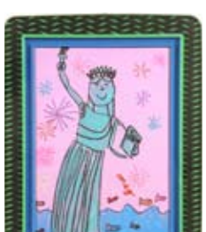
Art by Meg Haveman, age 7

Our new Paraflex Acrylic frames are all of these. Whether you're framing family photographs or original artwork, Paraflex protects, preserves and creates a showcase for your priceless treasures. We love to design with these creative frames. We choose shape, width, color and pattern; there are thousands of possible combinations.